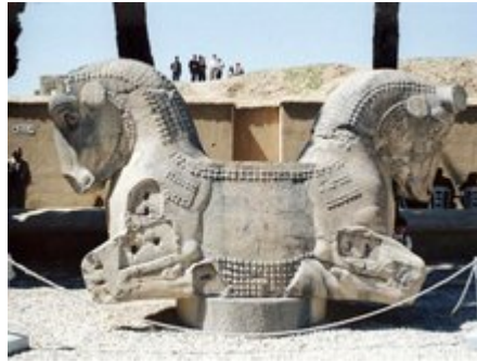
Statues of horses abound in Persepolis palace complex, pointing to the importance of horse in ancient Persia

The biggest horse riding festival in Iran will be held in April/May 2007 close to Persepolis historic complex in Iran's Fars province under the joint cooperation of sport tourism committee of Iran's Cultural Heritage and Tourism Organization (ICHTO), Iran's Equestrian Federation, and UNESCO.